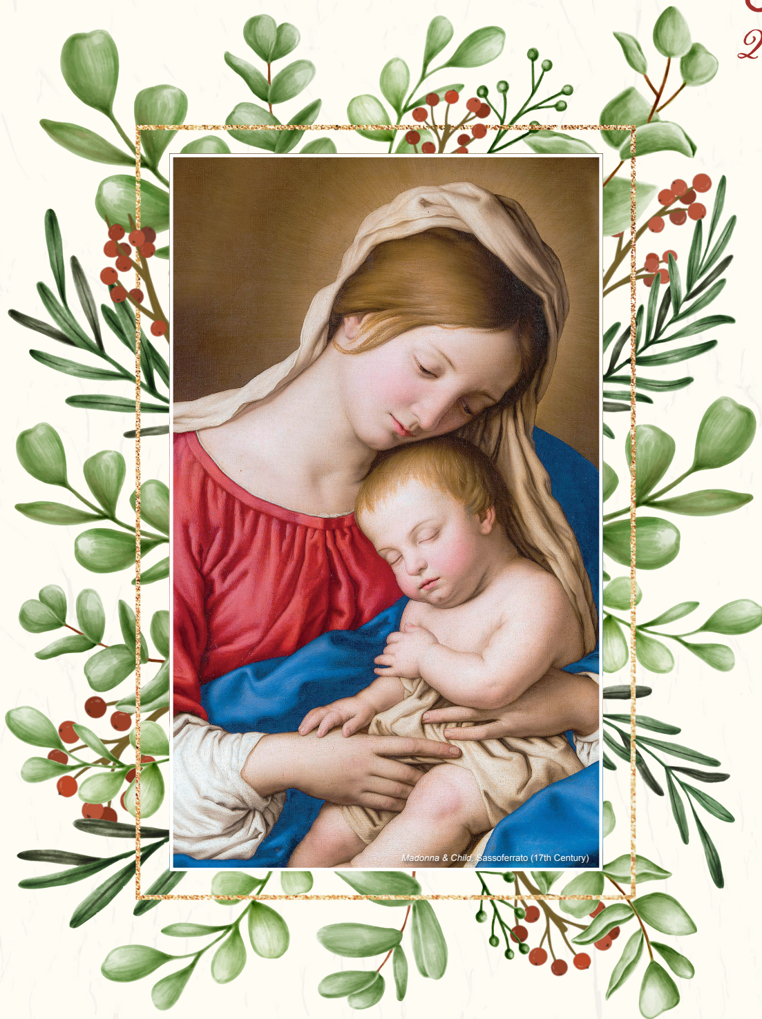
Madonna & Child, Sassoferrato (17th Century)